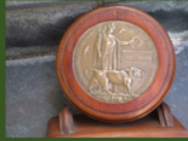
WW1 Memorial Plaque

Wherever they fought New Zealanders died Field Nurses wept and Families cried But still in mud and trenches long Our brave young ancestors defended strong Their visions of peace for all to share Often terminated in a Chaplain's prayer And graves in which they now lie deep In great respect the village people keep