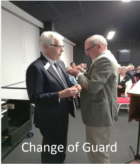
Change of Guard