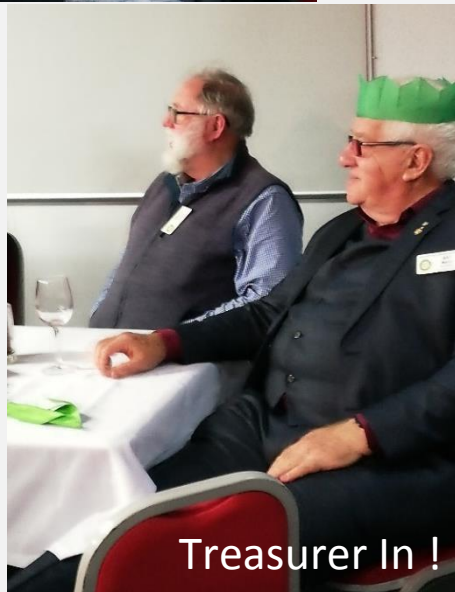
Treasurer In !