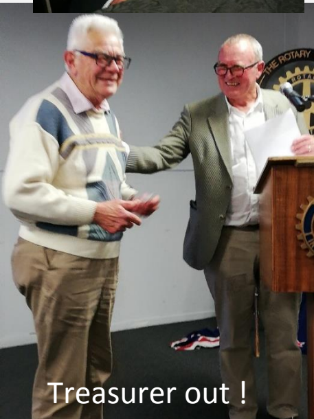
Treasurer out !