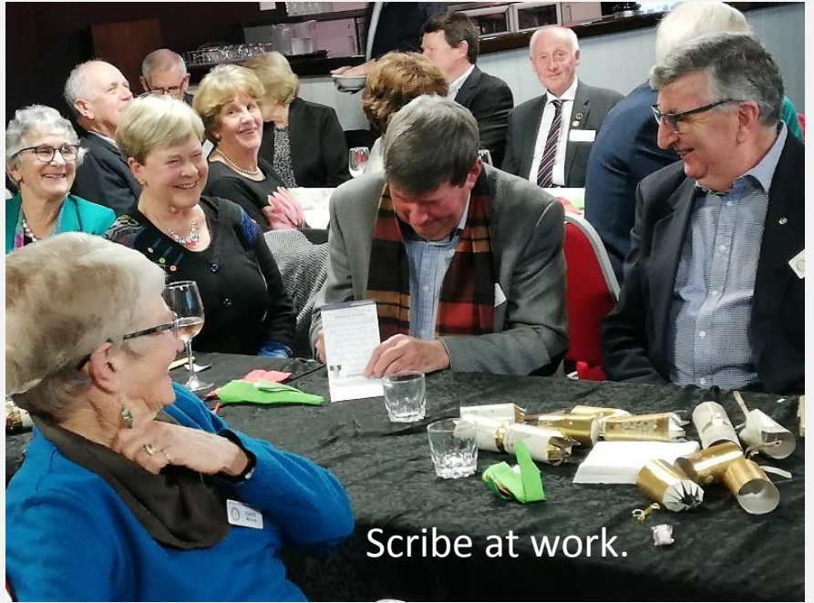
Scribe at work.